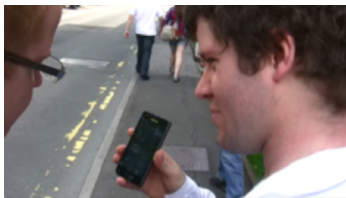
Figure 6: Study of mobile device notification co-management in collocated groups.

pointing, our empirical research has the ability to paint a perhaps complicated, yet valid picture of how technology-enhanced social encounters really play out, in a multitude of settings including at work, home, play, and travel. For example, in-depth ethnographic research has revealed the subtle and skilled ways in which we embed phone use in conversations in pubs (Figure 4) [19], living rooms (Figure 5) [20], and collaborative photo-taking (Figure 6) [6]. As Rooksby et al. point out, “technology does not feature in the living room as something that brings or breaks intimacy, but rather mobile devices are things that enter an intimate environment and are used with respect to intimacy” [20:257].