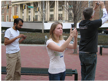
Figure 2: Mobiphos allows group of people to simultaneously capture and share photos.