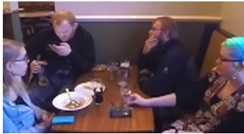
Figure 1: Ethnographic research has studied the use of mobiles in natural collocated settings.