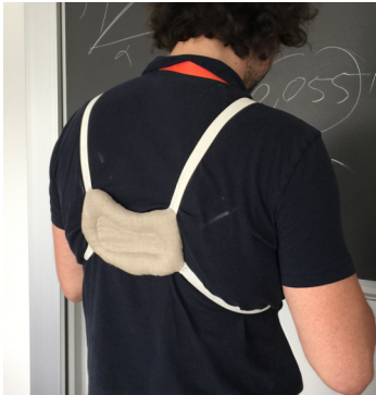
Figure 6. MobileHCI '15 workshop (afternoon, 'hands on', session): In teams, attendees used different materials consisting of fabrics, conductive fabrics, and assortments of various artefacts, to provoke thought and explore ideas around embodied and tangible interactions.

Martin Porcheron is a PhD student in the Mixed Reality Laboratory at the University of Nottingham. His work has focused on the use of mobile devices within collocated groups. His research includes examining the social implications of mobile device use and the positioning of mobile devices as resources that people can draw upon in conversations.