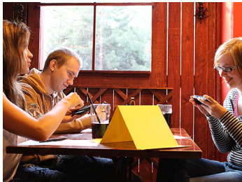
Figure 3: MobiComics allows collocated groups to curate and share comic strip panels.