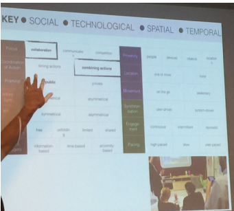
Figure 5: MobileHCI '15 workshop (morning session): Following presentations of accepted position papers, attendees worked together in small groups on tasks oriented toward acquainting themselves with the mobile experiences for collocated interactions framework [14].

In this workshop we will use a number of interactive activities, such as bodystorming, to explore ideas relating to the workshop goals to frame later tasks.